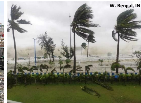
W. Bengal, IN